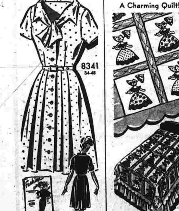
Soft New Casual

WANTED—Real Estate. Selling or buying residential, commercial or industrial real estate. Call MI 9-8439.