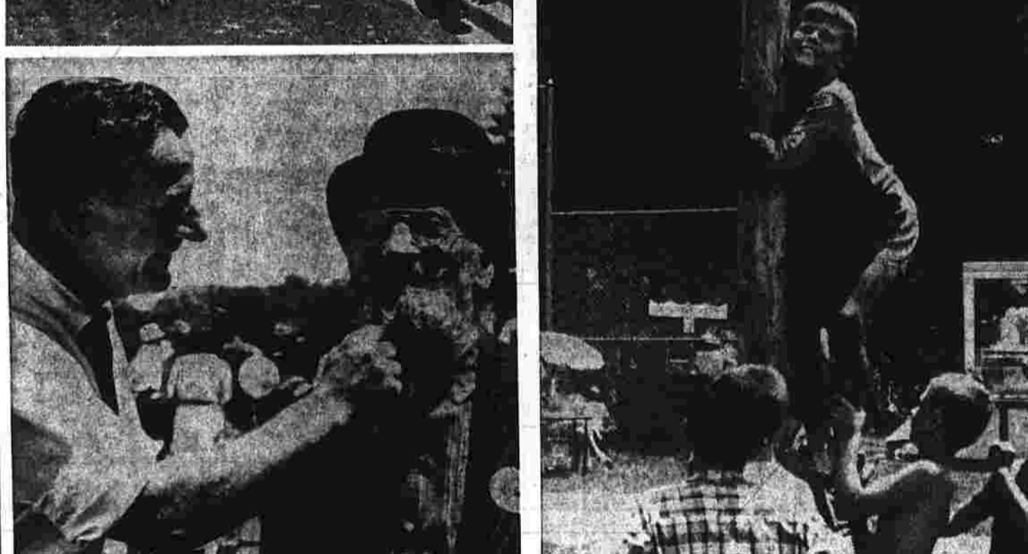
Coventry Thousands Take Part In 250th Wingding The Town of Coventry blew out the final candles on its 250th birthday cake Saturday with festivities that began with a colorful potpourri of the old and the new in the form of a parade.

Thousands Take Part In 250th Wingding By PATRICIA PLATT The Town of Coventry blew out the final candles on its 250th birthday cake Saturday with festivities that began with a colorful potpourri of the old and the new in the form of a parade.