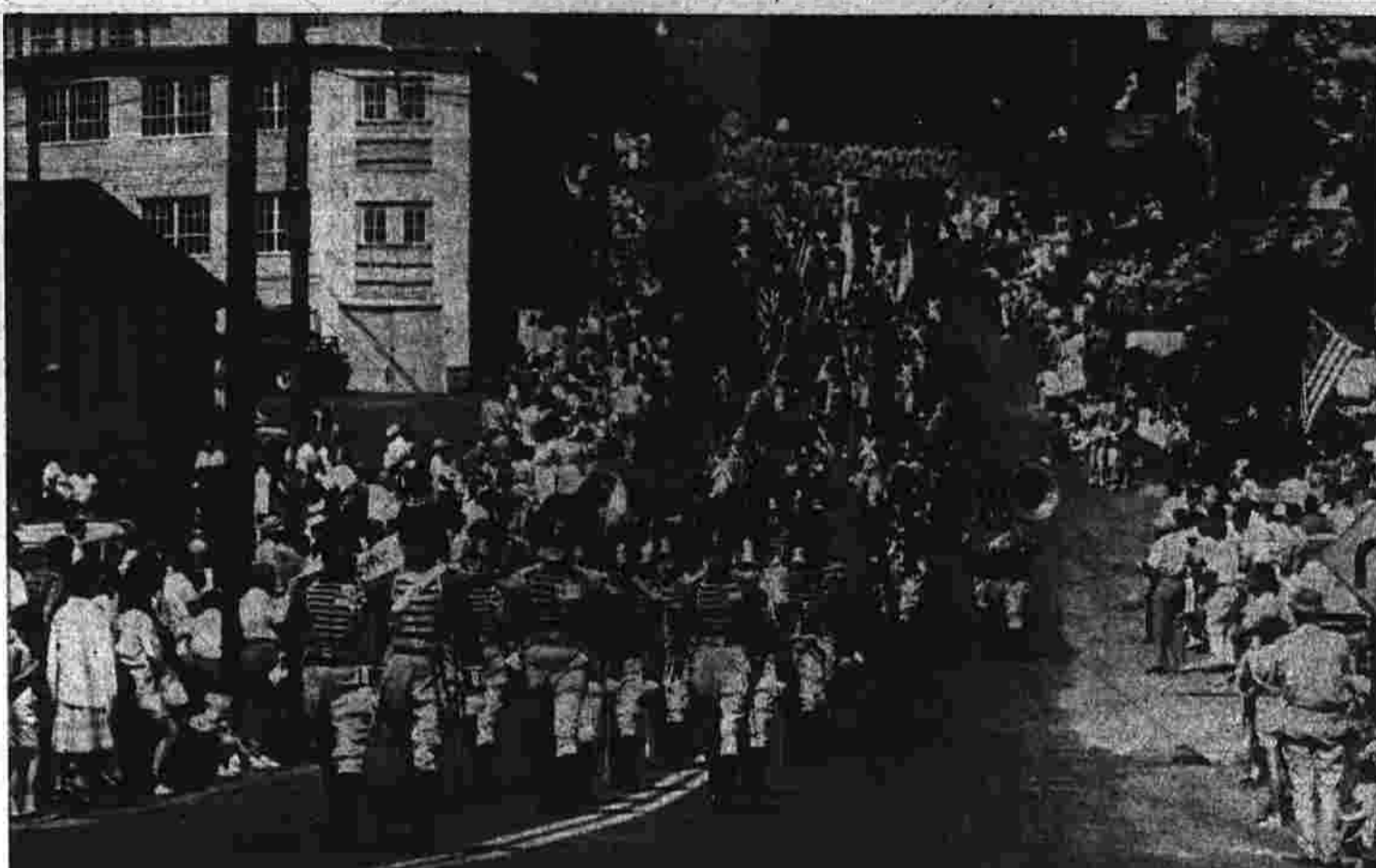
Red-jacketed men of the Governor's Foot Guard and hand march in the mid-morning sun down Coventry's Rt. 31, followed by National Guardsmen of the 2nd Battle Group, 169th Infantry. Below, twin oxen pull a cart with children in their old-fashioned Sunday morning finery.